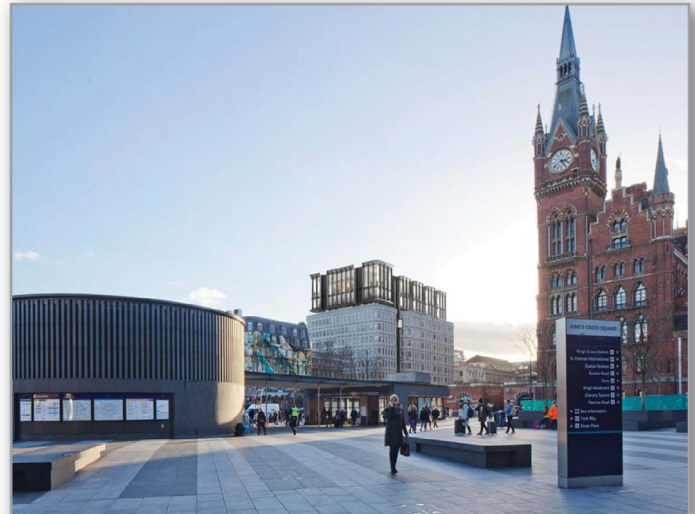
The proposed London Standard Hotel. Kings Cross, London

The M&E design by ARUP, currently being installed by Michael J Lonsdale, has cleverly utilised the majority of the Recoup Pipe+ HE units in a 2:1 scenario. Where 1 x WWHRS unit is connected to 2 x individual showers via back-to-back bathroom units, in an effort to maximise ROI.