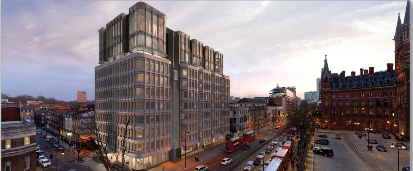
The proposed London Standard Hotel. Kings Cross, London

Hip American hotelier André Balazs has chosen a council office block in King's Cross for his next boutique hotel.